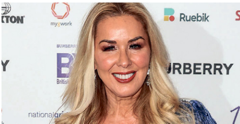
Claire Sweeney (she/her) Actor, singer and TV personality @ClaireSweeney

Beverley is an English singer, songwriter, actor and radio personality. She released her first album, The B-Funk, in 1995. Heavily influenced by American soul music icons such as Sam Cooke and Aretha Franklin, Knight has released nine studio albums. Her allyship for the LGBTQIA community is well-known and she says that her relationship with the community is very tight.