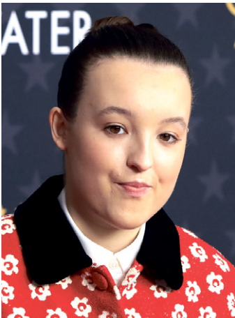
4 Bella Ramsey (they/them) Actor @BellaRamsey

Andrew is known for his roles in Sherlock, Fleabag, Pride and All Of Us Strangers. In early 2024, he spoke out about getting rid of the term 'openly gay' during a roundtable discussion for The Hollywood Reporter, and has been a vocal supporter of LGBTQIA rights across his career.