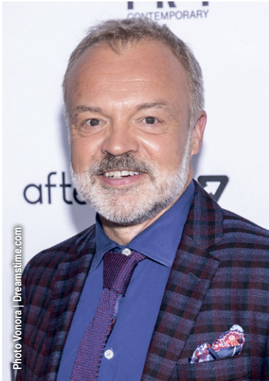
9 Graham Norton (he/him) Comedian, actor, author and TV presenter @grahnort