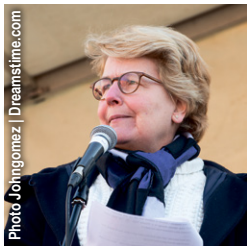
16 Sandi Toksvig OBE (she/her) Writer, comedian and broadcaster @sanditoksvig

Prize for LGBTQIA authors. She is a co-curator and host of Out-Spoken Live at the Southbank Centre, as well as being a Poetry Fellow at the University of East Anglia.