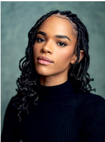
2 Yasmin Finney (she/her) Actor @yazdemand

Beginning his acting career on stage in Dundee, Ncuti is best known for co-starring in Netflix's Sex Education as Eric Effiong. He currently portrays the fifteenth reincarnation of the Doctor in Doctor Who, the first Black and queer actor to do so, and appeared in Greta Gerwig's Barbie in 2023.