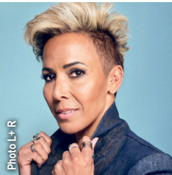
13 Dame Kelly Holmes DBE OLY (she/her) Double Olympic Champion and media personality @damekellyholmes