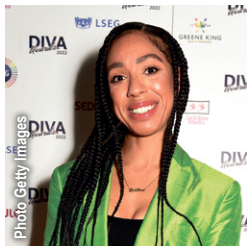
80 Pearl Mackie (she/her) Actor @Pearlie_mack