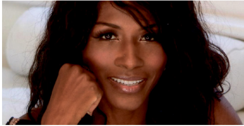
Sinitta (she/her) TV personality and singer @Sinitta

Sadiq won his third mayoral election in May 2024 and he consistently uses his platform to advocate for the rights of LGBTQIA Londoners. In 2022, he stood with the trans community after the UK Government failed to include trans people in a proposed ban on "conversion therapy". As part of Pride 2023, he announced new rainbow plaques to celebrate London's LGBTQIA communities.