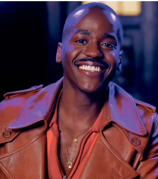
1 Ncuti Gatwa (he/him) Actor @ncutigatwa