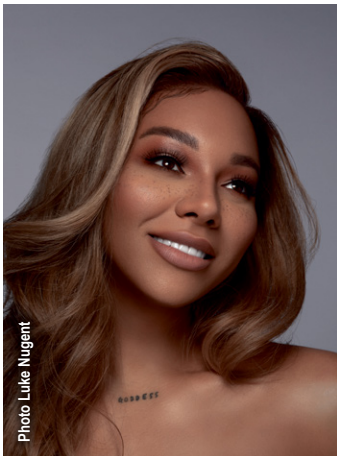
5 Munroe Bergdorf (she/her) Model and activist @munroebergdorf

Bella is a 20-year-old English actor and identifies as non-binary. They starred as Lyanna in Game Of Thrones, in Catherine Called Birdy, and most notably as Ellie in the HBO drama The Last Of Us alongside Pedro Pascal. They are an inspiring young voice in the queer community.