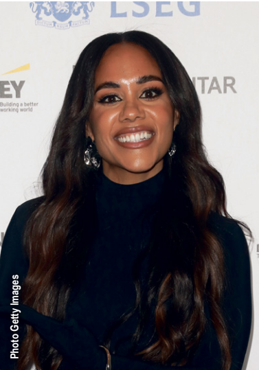
6 Alex Scott MBE (she/her) Sports commentator @alexscott2

A sports presenter, pundit and former professional footballer, Alex played as a right-back for Arsenal in the WSL and made 140 appearances for the England national team. She has been a vocal supporter of LGBTQIA rights across her career, notably wearing a rainbow armband while presenting the World Cup in Qatar in 2022.