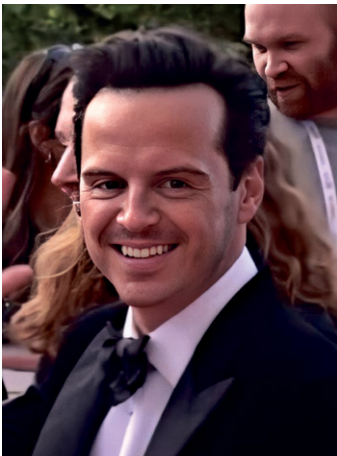
3 Andrew Scott (he/him) Actor #AndrewScott

Yasmin is an English actor and internet personality. Initially, Yasmin gained a following through her TikTok videos about her experiences as a Black British teenage trans woman. She starred as Elle Argent in the Netflix show Heartstopper and as Rose Noble in Doctor Who.