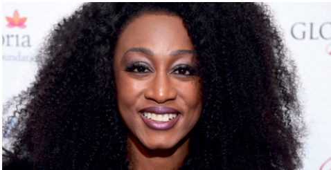
Beverley Knight (she/her) Singer-songwriter and actor @beverleyknight